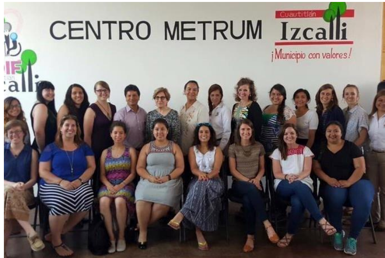
LOYOLA UNIVERSITY CHICAGO