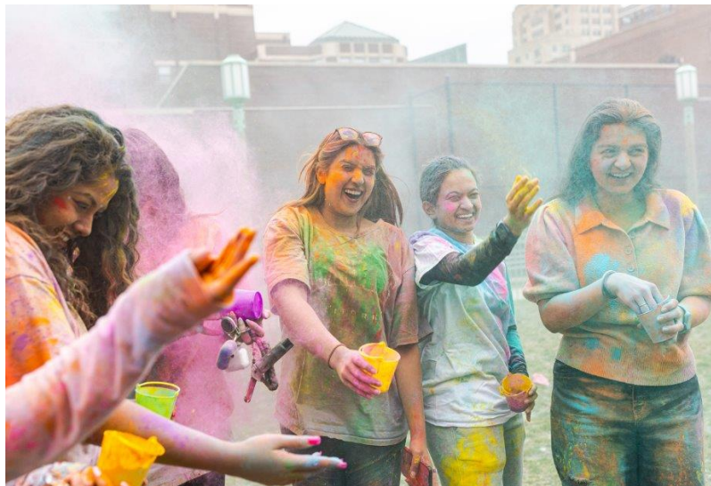
LOYOLA UNIVERSITY CHICAGO