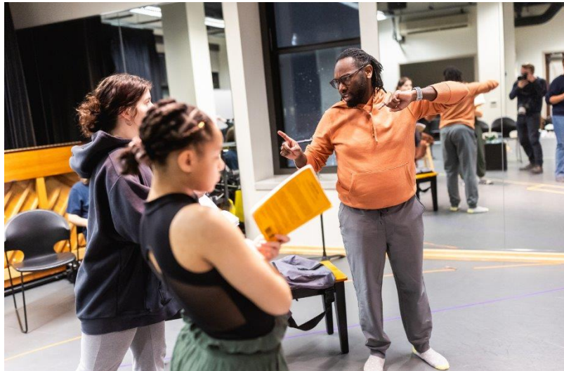
LOYOLA UNIVERSITY CHICAGO