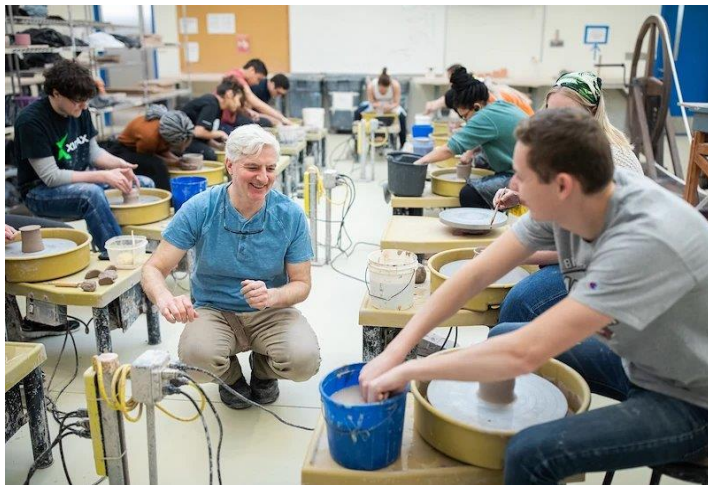
LOYOLA UNIVERSITY CHICAGO